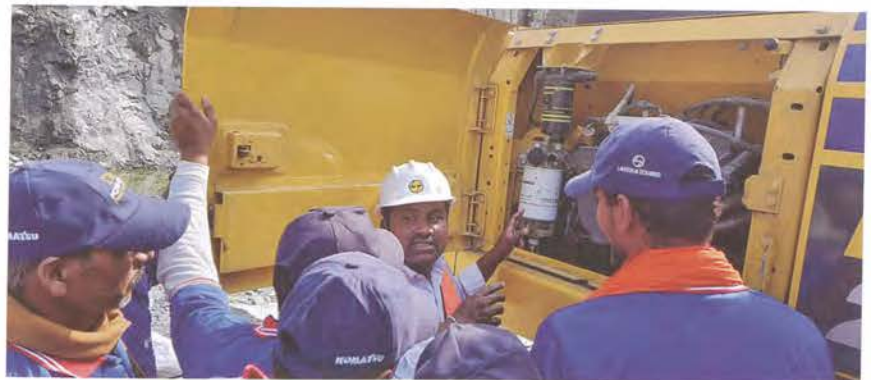
Training for operators on Komatsu machines in the field

L&T-CMB, during their 75 years of journey in this industry, have developed a Central Training Centre in Kanchipuram and five regional training centres across the country. We have well-equipped classrooms, machines, simulators, actual machine components for demonstration and experienced faculty to handle training. We even have portable simulators at regional centres so that they can be taken to jobsites where training can take place and trainees can save on travel time.