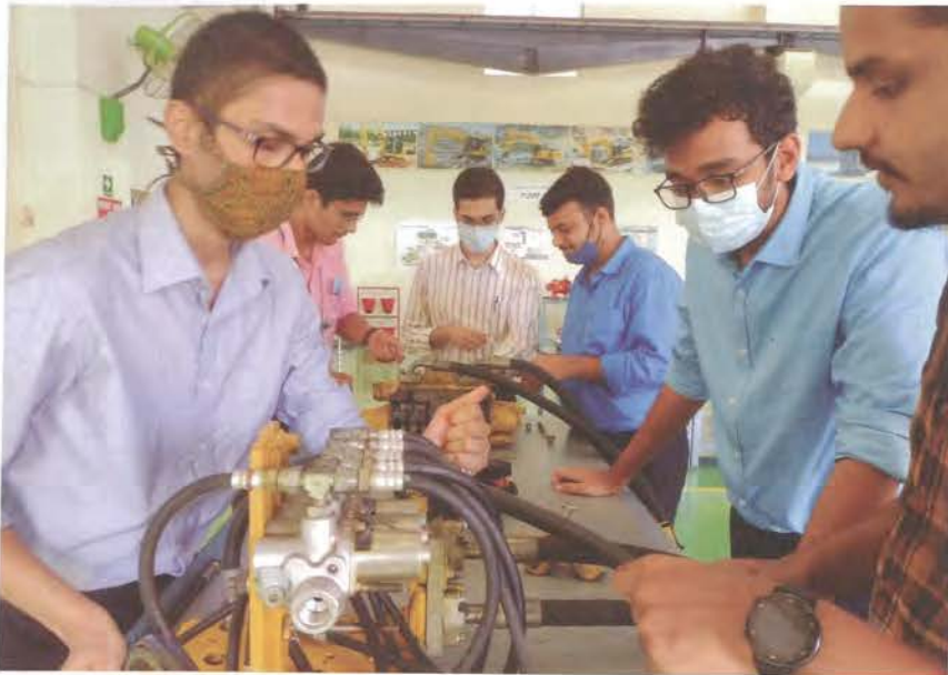
Training for new recruits at L&T Training Centre

For an excavator, proper bench preparation, swing angle, and the bucket attack angle are some of the factors that enhance productivity. Understanding monitor panel, the eco-guidance and caution that they exercise, are areas which an operator should be conversant with.